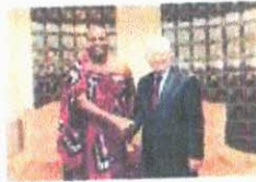
His Royal Highness Mswati III - King of Eswatini