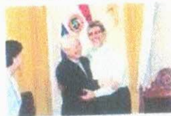
President Fernando Lugo of Paraguay