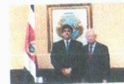
President Carlos Alvarado Quesada of Costa Rica