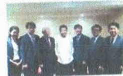
President Rodrigo Duterte of the Philippines