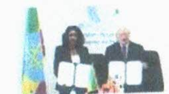
MOU with the Ministry of Peace Federal Democratic Republic of Ethiopia