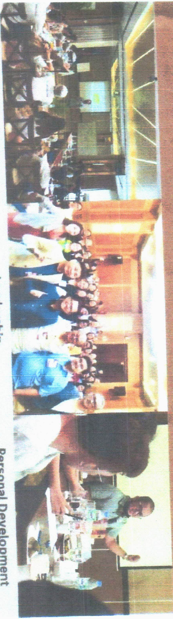
Basic Financial Management